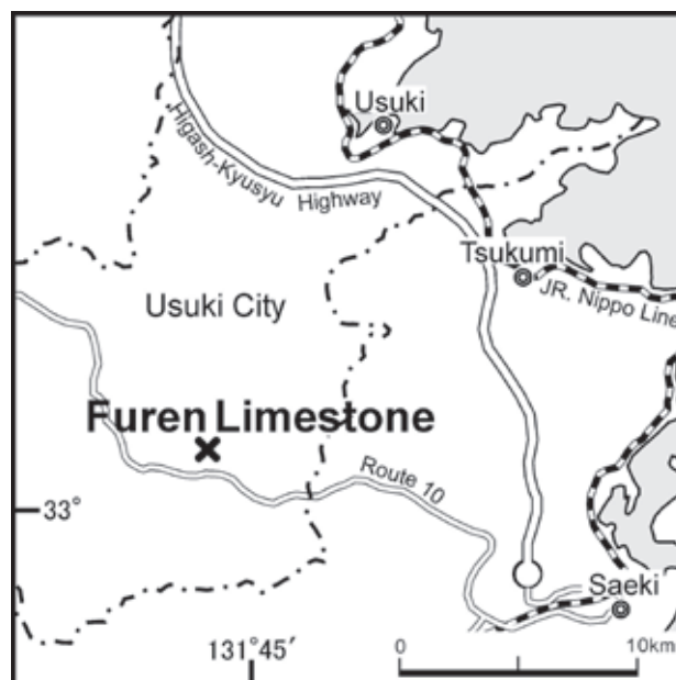
Figure 1. Location of the Furen Limestone.

(Kambe and Teraoka, 1968). However, paleontologic description of Paleozoic foraminifers is very few in this area and almost confined to that of Huzimoto (1937).